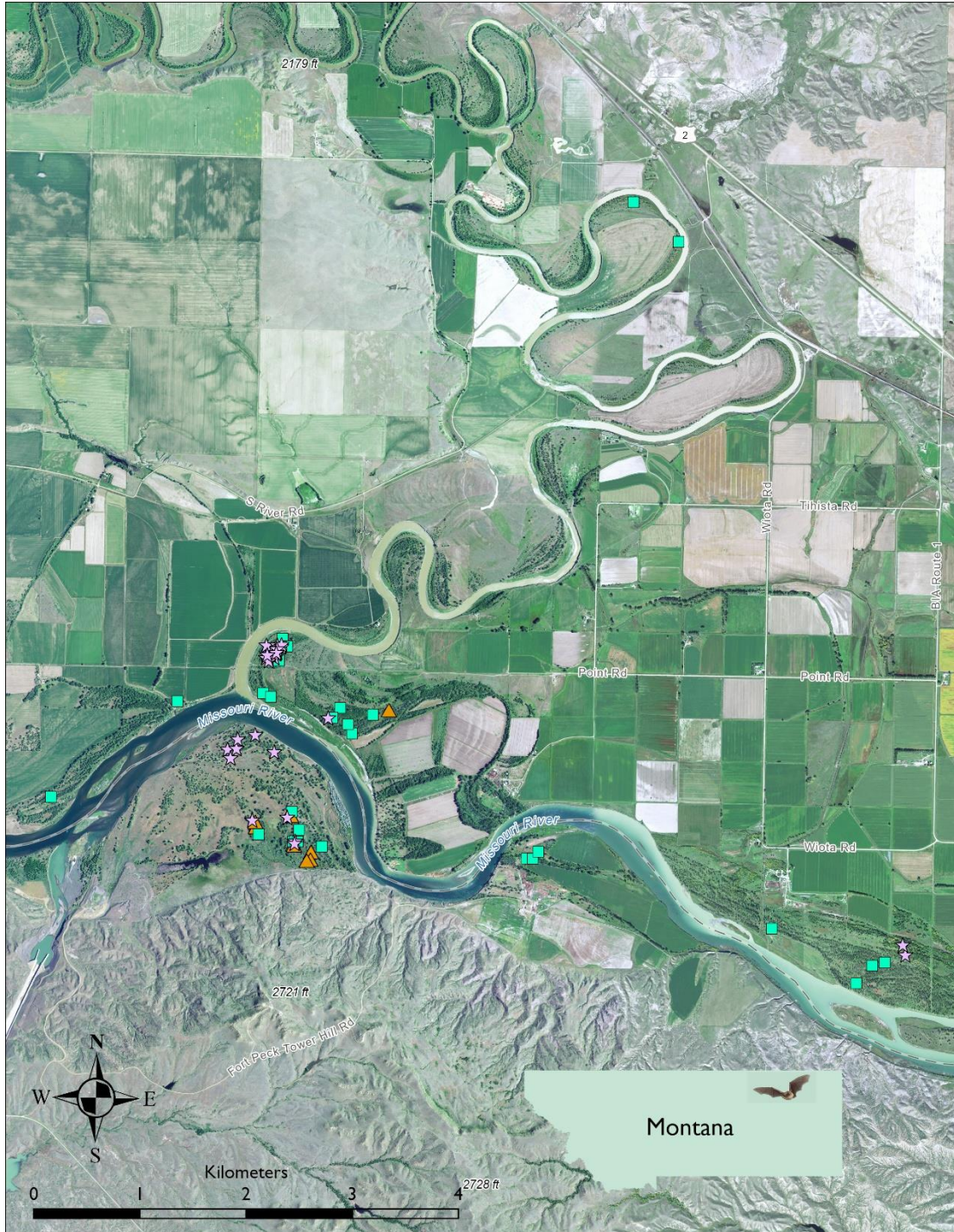
Figure 2. Northern myotis roost locations from 2022 and 2023 on the confluence of the Milk and Missouri rivers in northeastern Montana, depicted by the northern myotis in the inset map. Roosts are distinguished based on sex and reproductive status: reproductively active females = pink stars, non-reproductive females = blue/green squares, and males (all non-reproductive) = orange triangles.