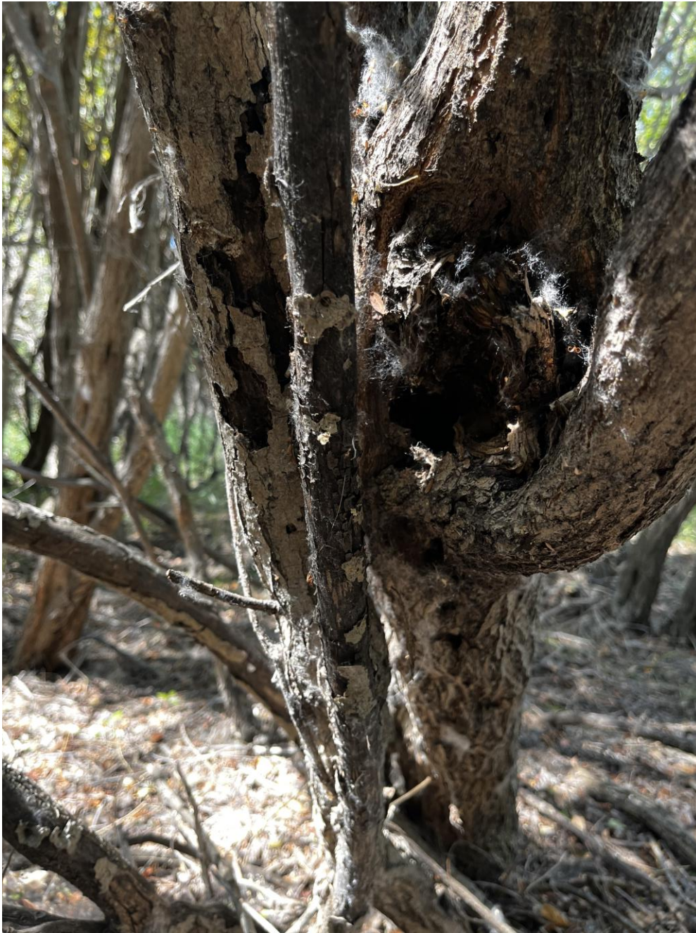
Figure 3. The only confirmed cavity roost we found, in northeastern Montana, 2022. This represents an atypical roost for our study. The bat, a reproductively active female, inhabited it for only a day.