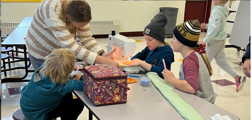
Members of Old Agency 4-H Club make pillowcases for CASA