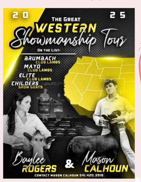
There is financial assistance available to help cover the cost for this clinic.

Please reach out with any questions/concerns! I'm always available to help, don't be shy! 406-949-2528