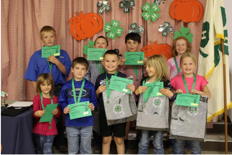
Cloverbuds received recognition and graduation gifts at Achievement Day.