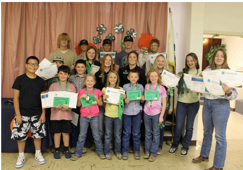
Members display their hardware and smiles after Achievement Day and root beer floats