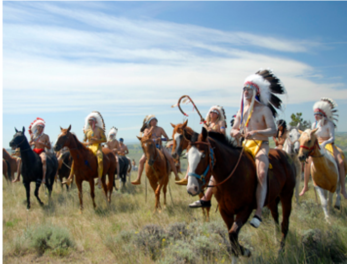
Men's Health Ride on June 24, 2008.