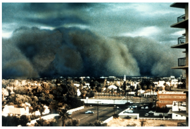
What is a dust storm?

A dust storm is a huge cloud of dust that moves across the landscape engulfing everything in its path.