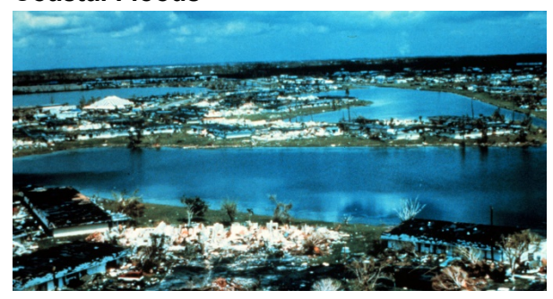
What is a coastal flood?

A coastal flood happens when ocean water floods the nearby land.