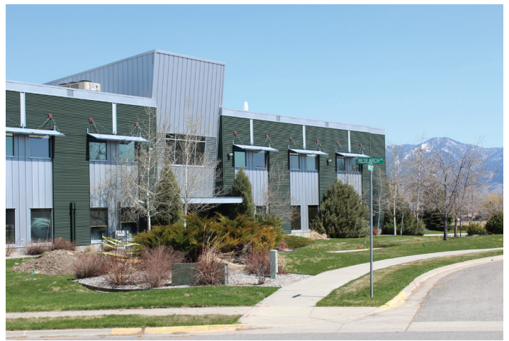
CAIRHE’s new home at the corner of Research Dr. and Analysis Dr. in Bozeman.